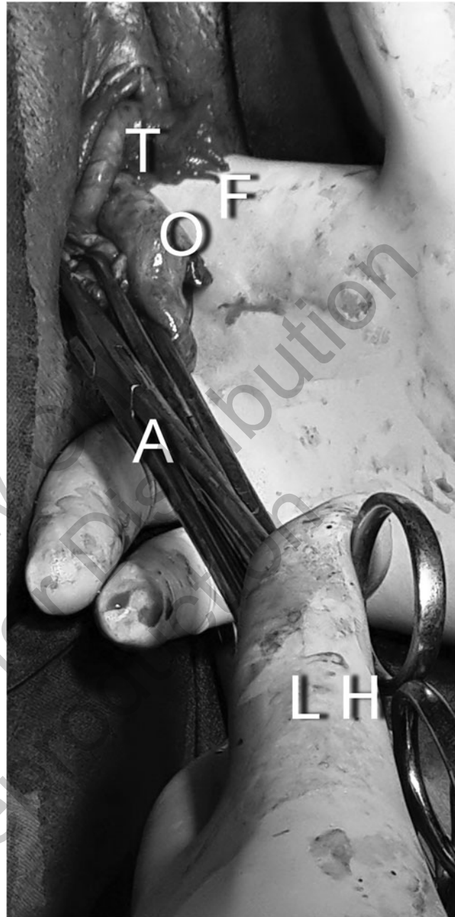
FIG. 3. Adnexa mobilization. The left hand (LH) is holding stumps of the round ligament, ovarian ligament, and Fallopian tube (T), using Allis forceps (A). The right hand's index and middle fingers (F) are inserted through the vaginal vault. The ovary (O) and Fallopian tube of the right side are accessible following mobilization.

Table 1 shows indications for adnexectomy among 226 patients. The commonest benign indication among others was